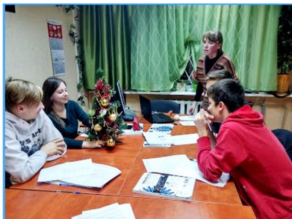
Picture 3. Attaining of a friendly, relaxed atmosphere

Of course the strong increase of successful implementation should be enabled by means of authentic materials and attempts of creating a natural atmosphere at the lessons as well as independent work encouragement which will help to preserve the feeling of so-called immerse beyond the studying process.