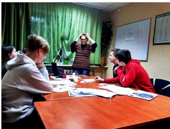
Picture 4. Teachers' own inspiration and involvement is the best model to follow

Among discussed things the last but obviously worth mentioning is a psychological side of teaching any foreign language. It is crucial for teaching Ukrainian students in terms of noticeable communicative problems and phobic attitude to conveying own thoughts, debating or asserting their rights the same as negotiation. Teachers' incompetence on an equal basis with restraining and authoritarian behavior may result in heavy psychological disgrace to studying. Frequently underlined prevailing position of the teacher may be harmful for student confidence and can provoke irresponsiveness and lack of interaction especially in the case with adults and students of higher educational establishments who are mature enough to realize own failures sharply.